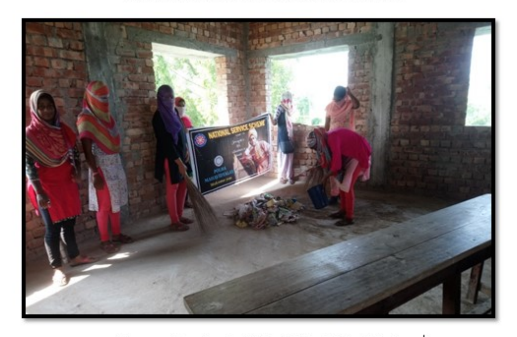
Campus cleaning by NSS & Eco-Club Volunteer