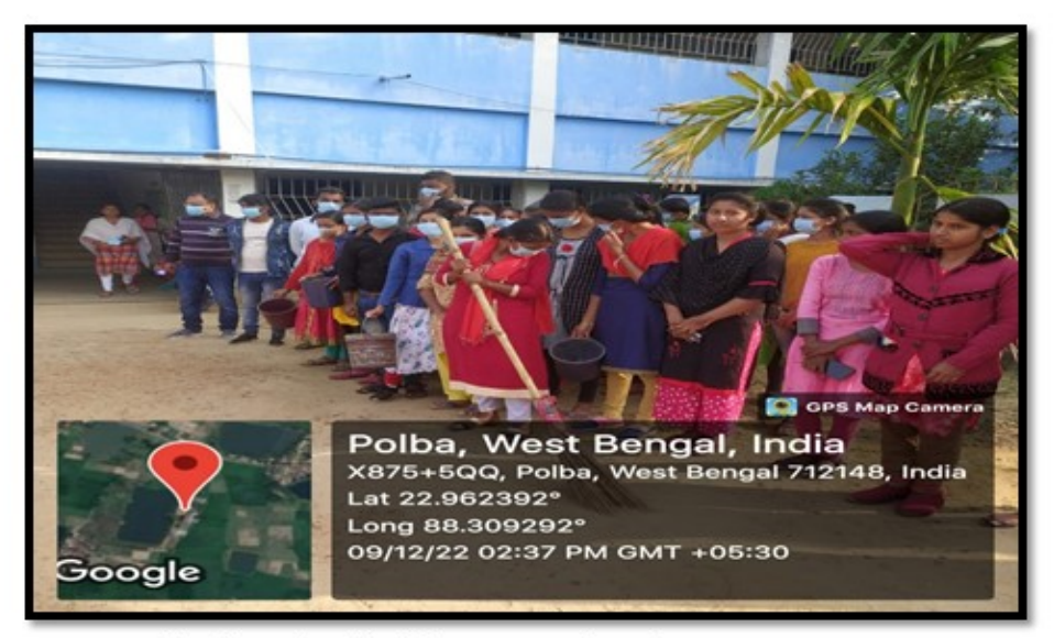
Students involved in campus cleaning