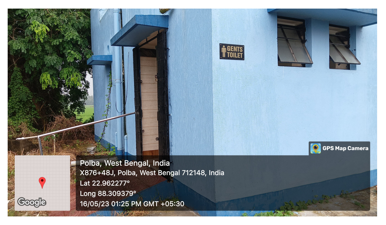
GENTS TOILET WING WITH RAMP