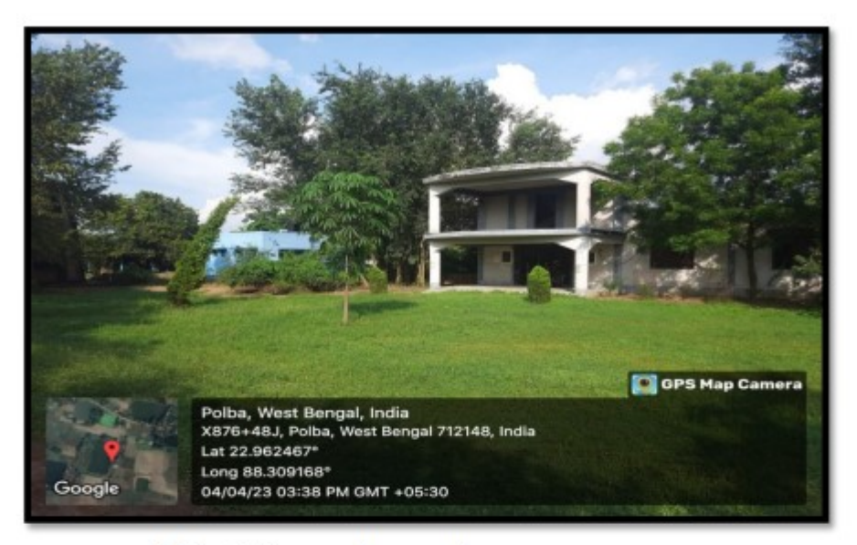
Maintaining a clean and green campus