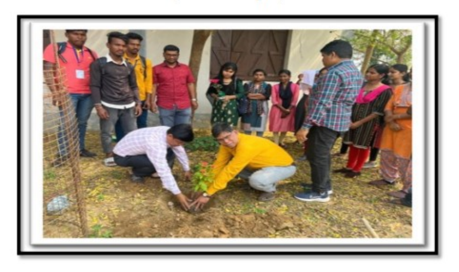
Planting new saplings