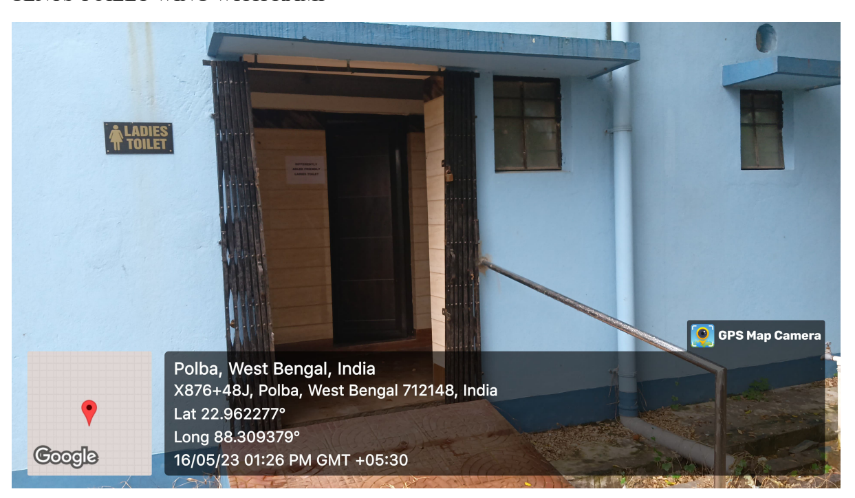
LADIES TOILET WING WITH RAMP