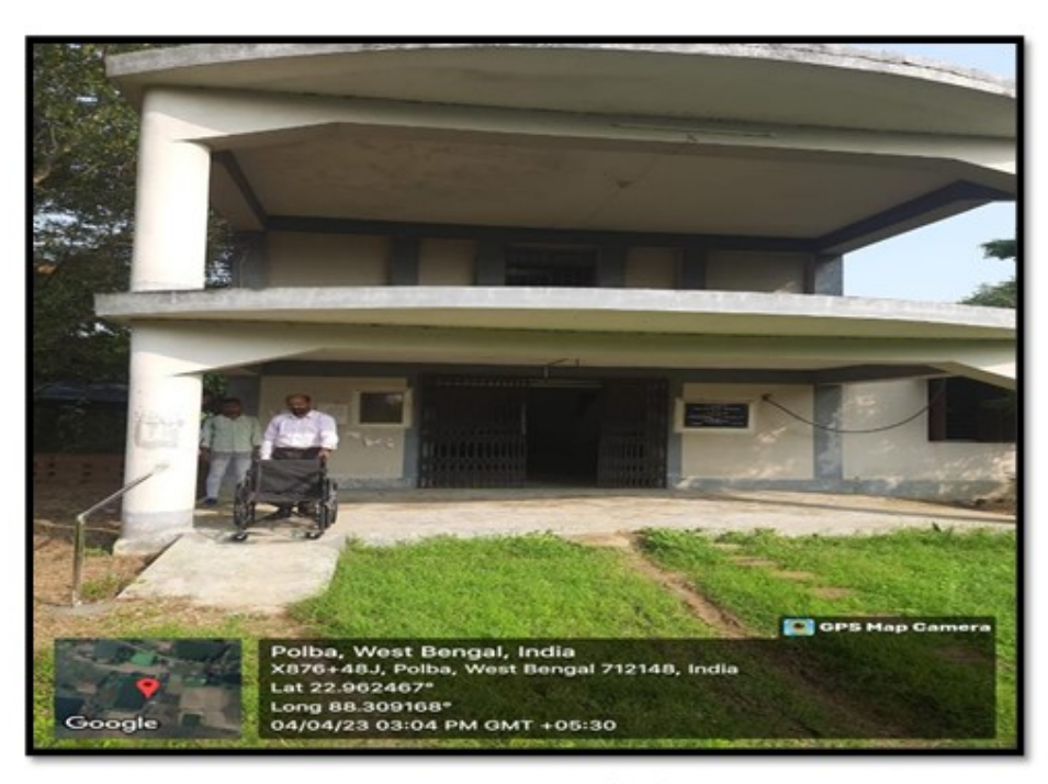
Ramp and Wheel Chair