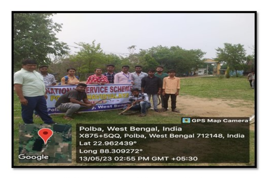
NSS volunteer engaged in campus cleaning