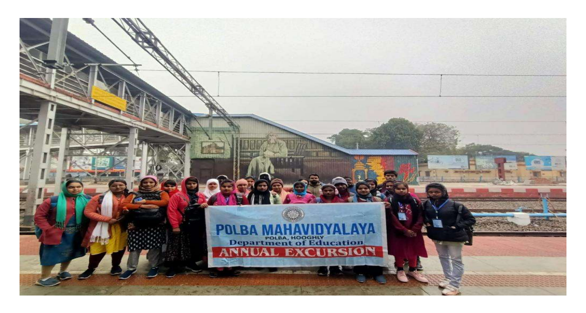
At Bolpure Station we reached at 8:45 in the morning