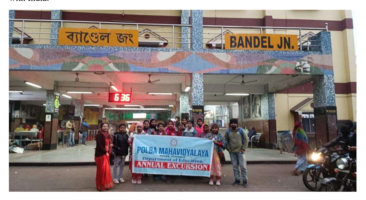
The journey started from Bandel Jn. Station at 6:30 in the morning

On 18 January 2024, 22 students of Department of Education with 3 faculty members went for a trip to Santiniketan with an aim of visiting Viswabharati University which was founded by Rabindranath Tagore who called it Visva-Bharati, which means the communion of the world with India.