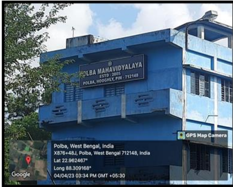
Building Overhead Water Tanks