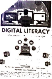
WB- Digital Literacy.png 697K