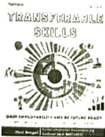
WB - Transferable Skills (1).png 1060K