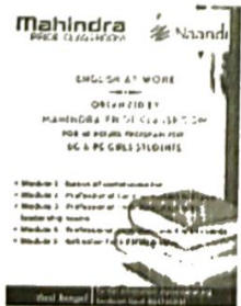
Eng for Work..jpeg 232K